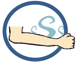
Steam does not rise from his body in the winter