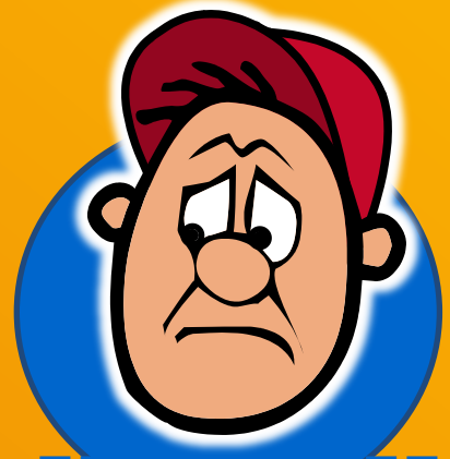
LOSS OF INCOME