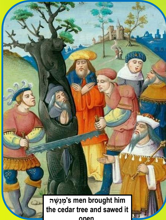
מְנַשֶּׁה's men brought him the cedar tree and sawed it open.

The prophet, יִשְׁעִיָּה (Isaiah) was one of the greatest the Jewish people has ever seen. One would never expect his grandson to be the wicked king, מְנַשֶּׁה (Manasseh)!