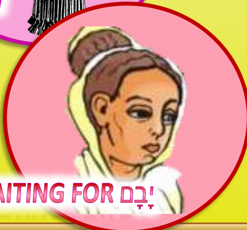
WAITING FOR יבום!

If a man married one of two sisters but forgot which one, and dies, both sisters perform הליצה and the living brother marries neither.