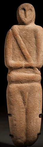
An ancient Canaanite idol