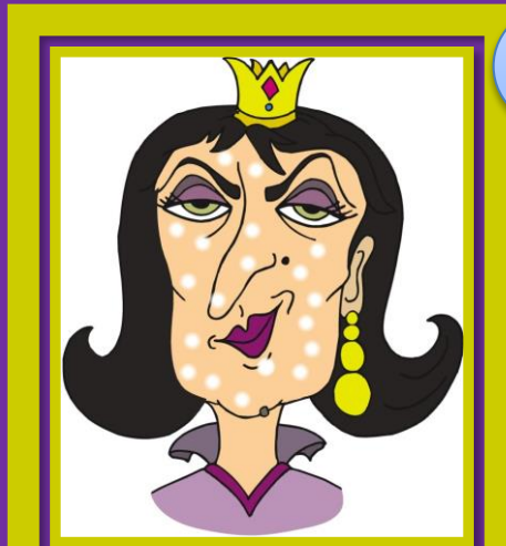
Vashti broke out with a skin disease and she did not want to be seen at the banquet

"From the day that the Temple was destroyed," they told the king, "our ability to give advice has been taken from us."